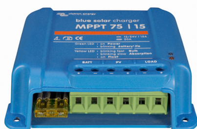
Solar charge controller MPPT 75/15